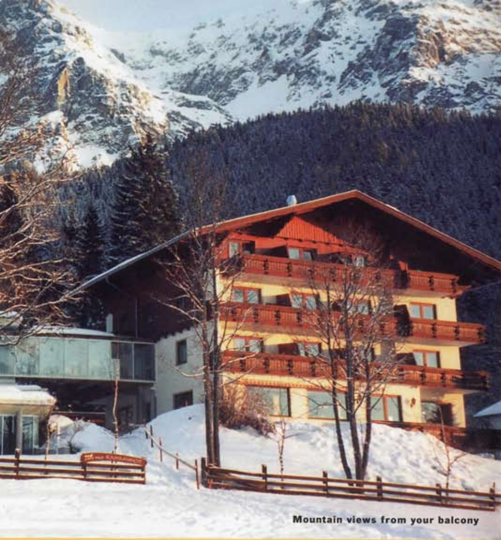
Mountain views from your balcony