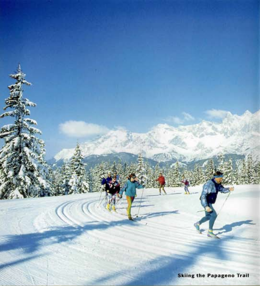
Skiing the Papageno Trail